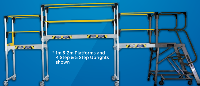
Combination Variable Height 1m & 2m Extension Configuration*