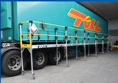
Transportation and Logistics

Specifically designed for adaptation to Transportation Industries, Aviation /Aircraft Maintenance, Manufacturing / Process Industries, Heavy Equipment Maintenance, Material Handling / Stock Picking, Warehousing and Mining Services Industries.