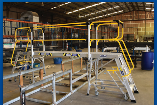
Manufacturing and Processing