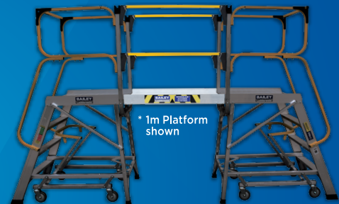
1m Bridge Configuration*